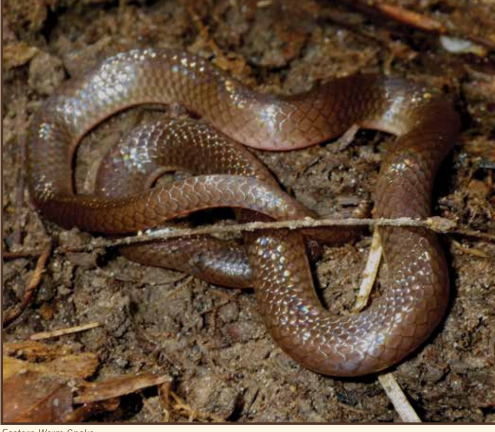
Eastern Worm Snake

Not so fast folks. During September and October the average highs for the Lake James area are 81- and 72-degrees respectively. Those temperatures are well within the range for snakes and other cold-blooded animals to